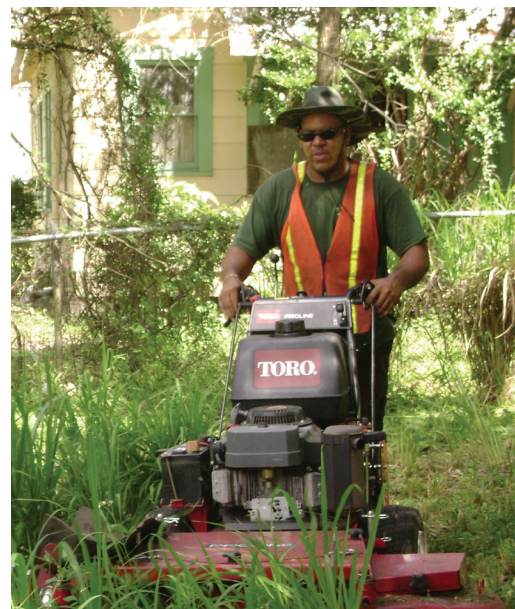
Clean City staff member mowing vacant lot.

If you have any questions or concerns, call the Clean City hotline at (813) 931-2133.