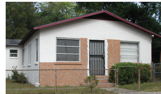
House at 3612 Shadowlawn was brought into code compliance.

If you have received a notice of violation, have difficulty coming in to compliance, or would like to register a complaint, please contact the department at (813) 274-5545 or visit them on the web at www.tampagov.net .