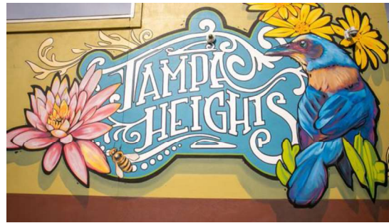
Tampa Heights Riverfront