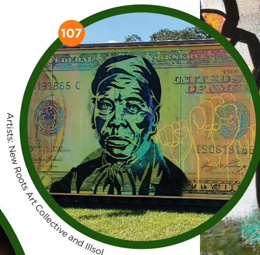
Artists: New Roots Art Collective and IlSol